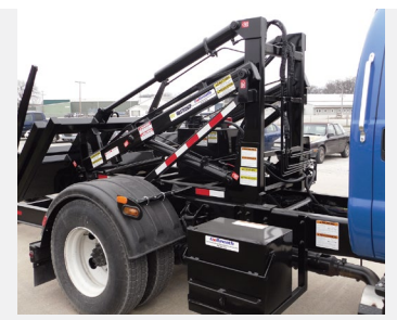
Extra CA can be added for storing lids, welders, toolbox, etc.