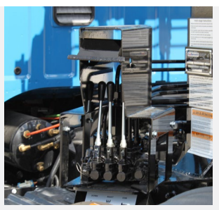
Outside controls with safety cover