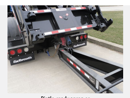
Pintle-ready apron or Reese hitch options available