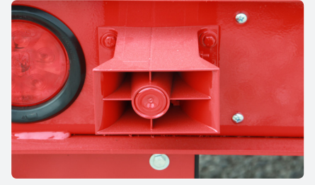
The hoist-up alarm is a standard safety feature. When hoist is engaged, alarm will sound, warning of hoist and container movement.