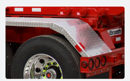
Optional full aluminum diamond plate fenders shown. Quarter poly rear fenders are standard.