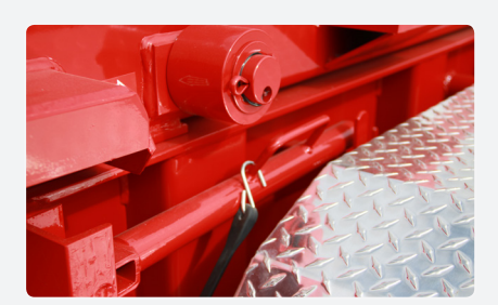
All trailer hoists have dual safety props to add extra security when the hoist is in the up position. 7 rollers per side help aid the container as it is loaded or unloaded on the hoist. Each roller is equipped with a bearing and a grease fitting for easy rolling and maintenance.