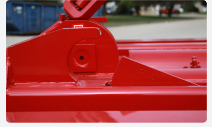
Automatic front container spring-loaded locking system and rear container hold-downs help ensure container remains in place.