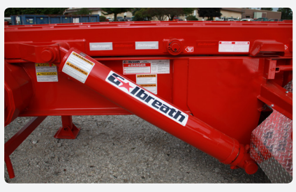
2 cylinders are mounted on the outside of the rails to provide stability when loading/unloading heavy boxes.