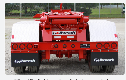
"Plug n' Play" wiring system eliminates crossed wires, loose connections, corrosion and splices; allows for simple light replacement.